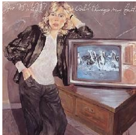
After a three-year hiatus, Mitchell returned to the limelight with her promising, but mixed offering of 1982, Wild Things Run Fast

Moon at the Window is fluid jazz-pop, while Chinese Café , with its "nothing lasts for long" refrain, captures her sad-joyous realisation of standing alone on the threshold of middle age. The album reaches a moving finale with Love , a jazz-pop adaptation of verses from Chapter 13 from the first Book of Corinthians in The Holy Bible . Although the explicit religious symbolism and archaisms were eliminated, Mitchell preserved the intrinsic beauty of the original verse.