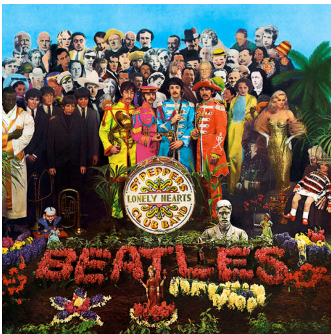
Revolver , along with Sgt Pepper's (above), captures The Beatles at the creative best

The sound effects on Yellow Submarine included real submarine noises, as well as Harrison swirling water in a bucket, Lennon blowing bubbles through a drinking straw and an English brass band, courtesy of George Martin, who spliced together cut-up recordings from an old, uncredited 78-rpm record. Lennon and McCartney provided the mid-section nautical chatter for the submarine crewmen.